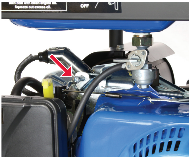
3750 & 3750-PRO